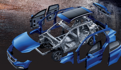
Ultra-High Tensile Steel Cage Body