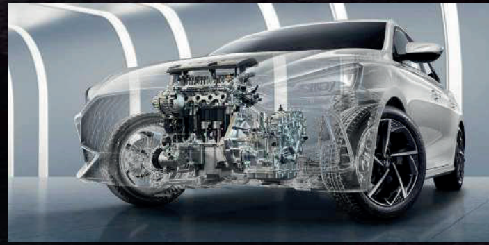
CVT 7 SPEED AUTOMATIC TRANSMISSION