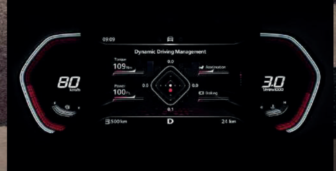
DYNAMIC DRIVING MANAGEMENT