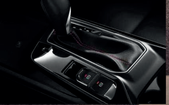
ELECTRONIC PARKING BRAKE (EPB) AND AUTO VEHICLE HOLD (AVH)