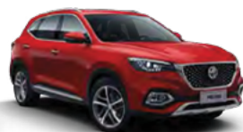
FARRINGDON RED Metallic*

*Metallic paint optional and at extra cost.