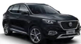
BLACK PEARL Metallic*