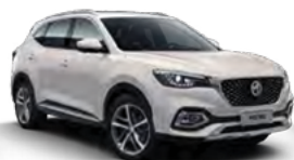
WHITE PEARL Metallic*