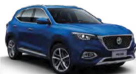
BRIXTON BLUE Metallic*